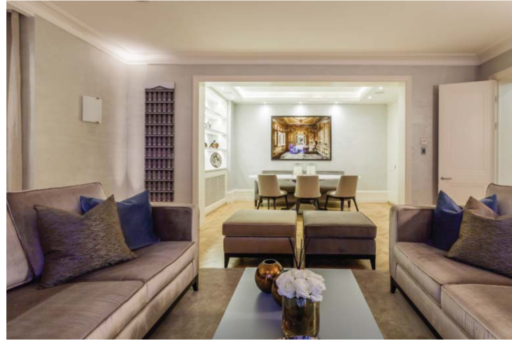
DRAWING ROOM & DINING AREA