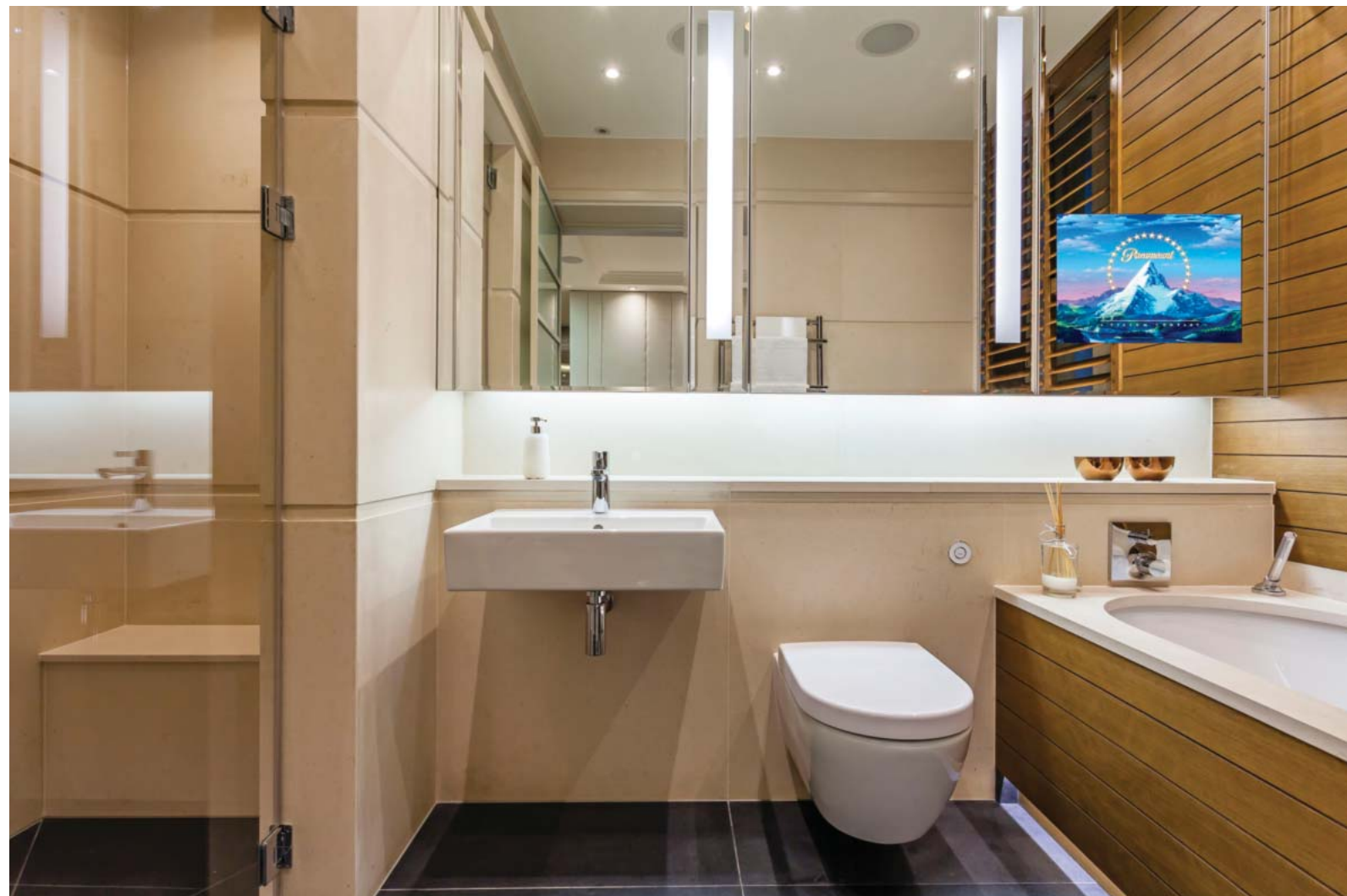
MASTER EN-SUITE BATHROOM