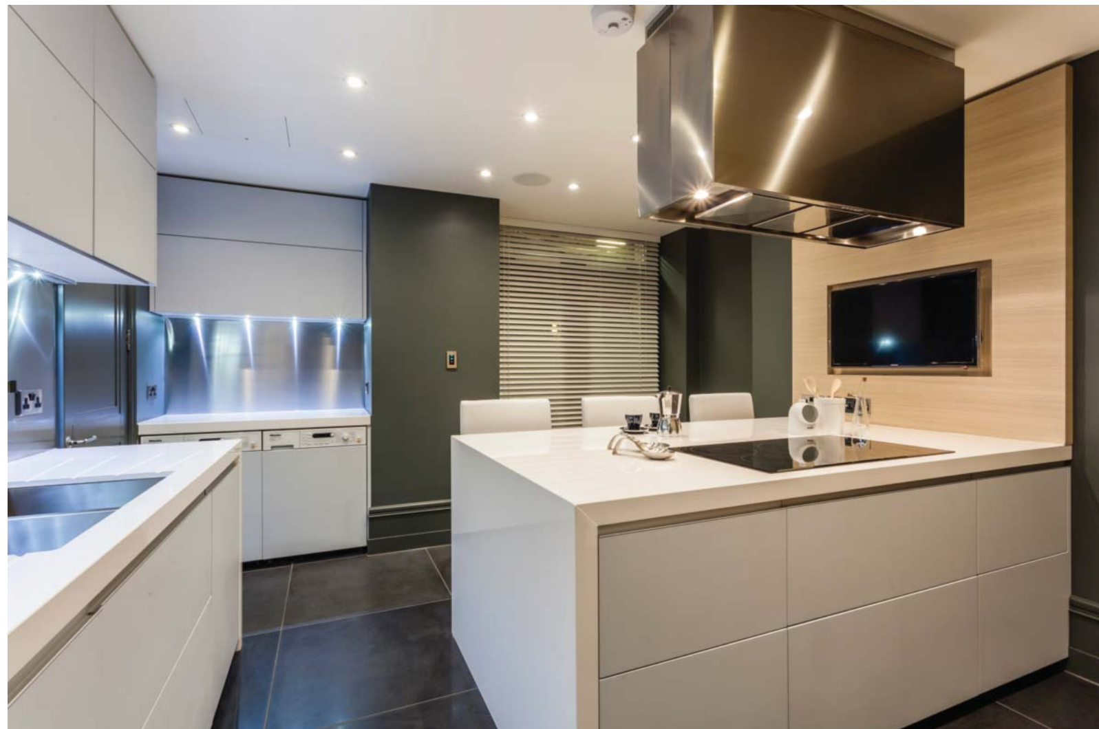
FULLY INTEGRATED ISLAND KITCHEN