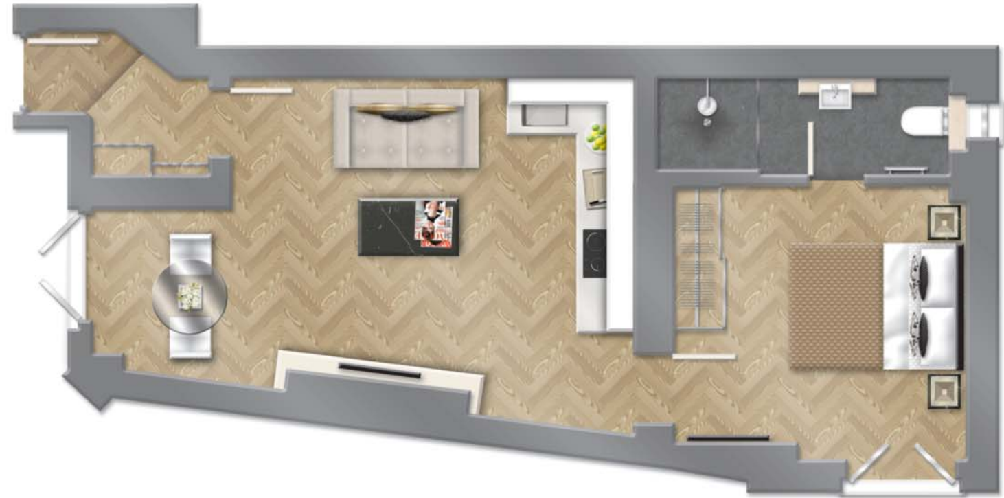
1 Bedroom Apartment Total area: 40.9 sqm (440 sqft)

This prestigious one bedroom apartment has also been meticulously finished and equipped for highly refined living at Harley House.