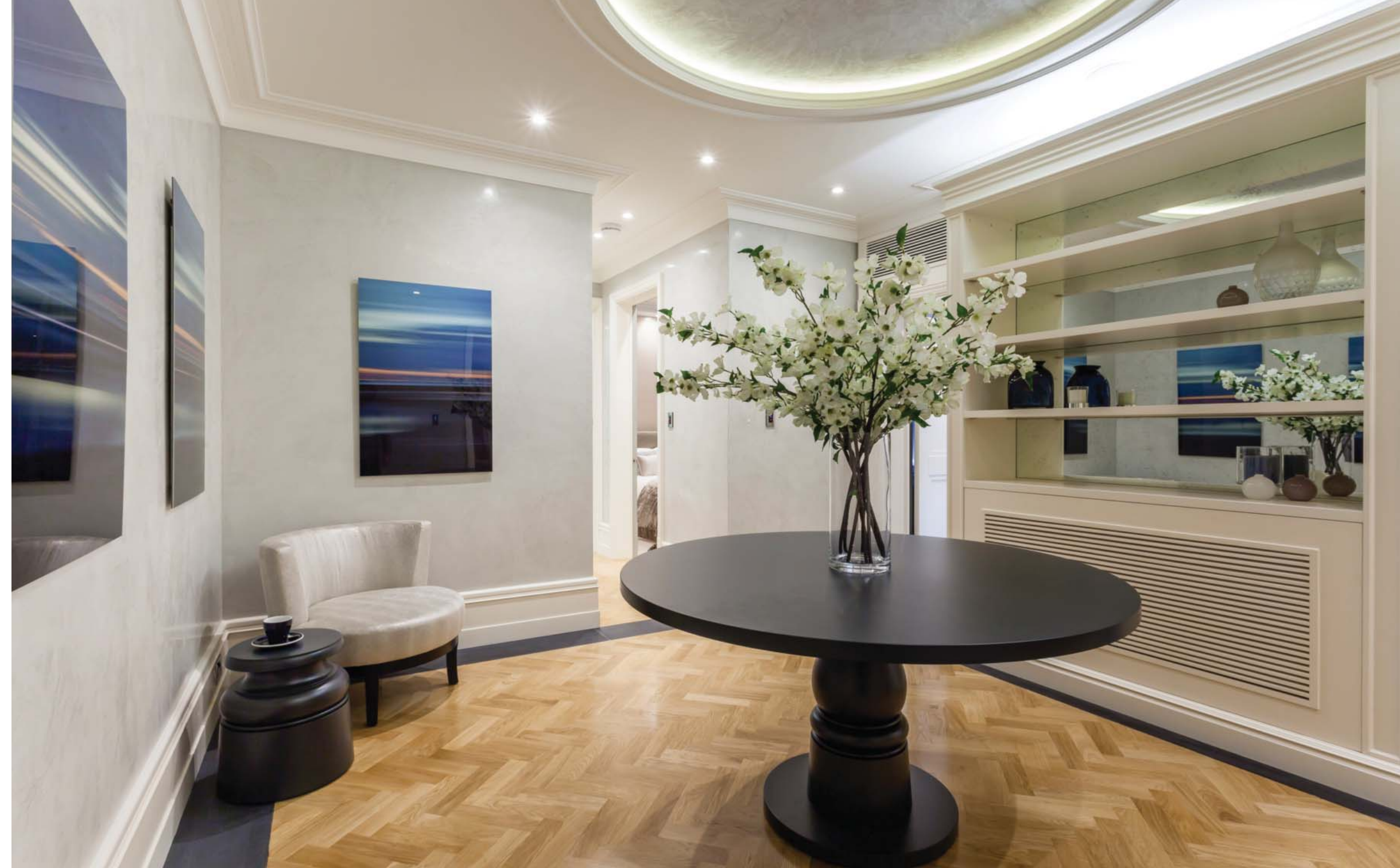
RECEPTION & ENTRANCE HALL