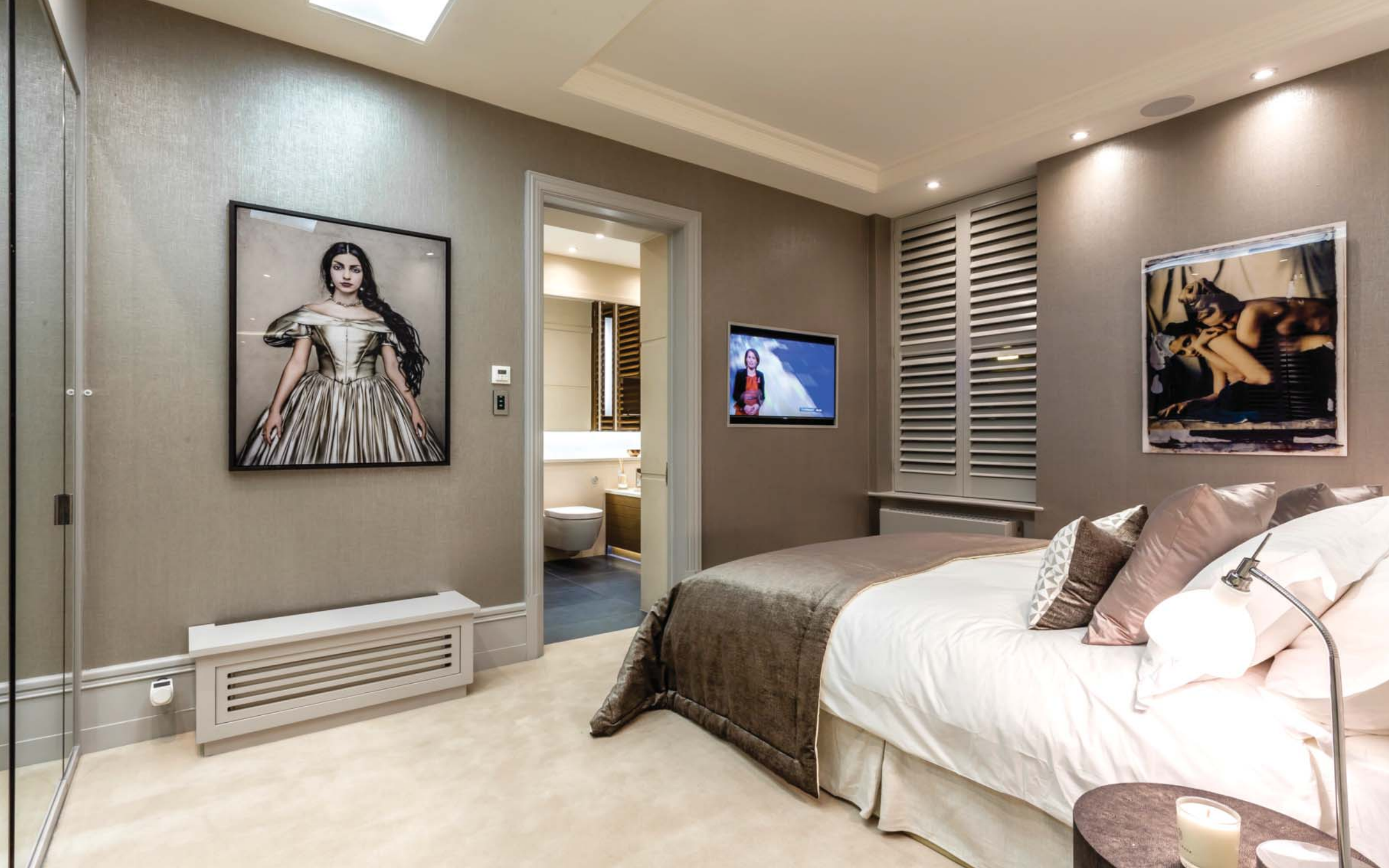
MASTER BEDROOM & GUEST BEDROOM