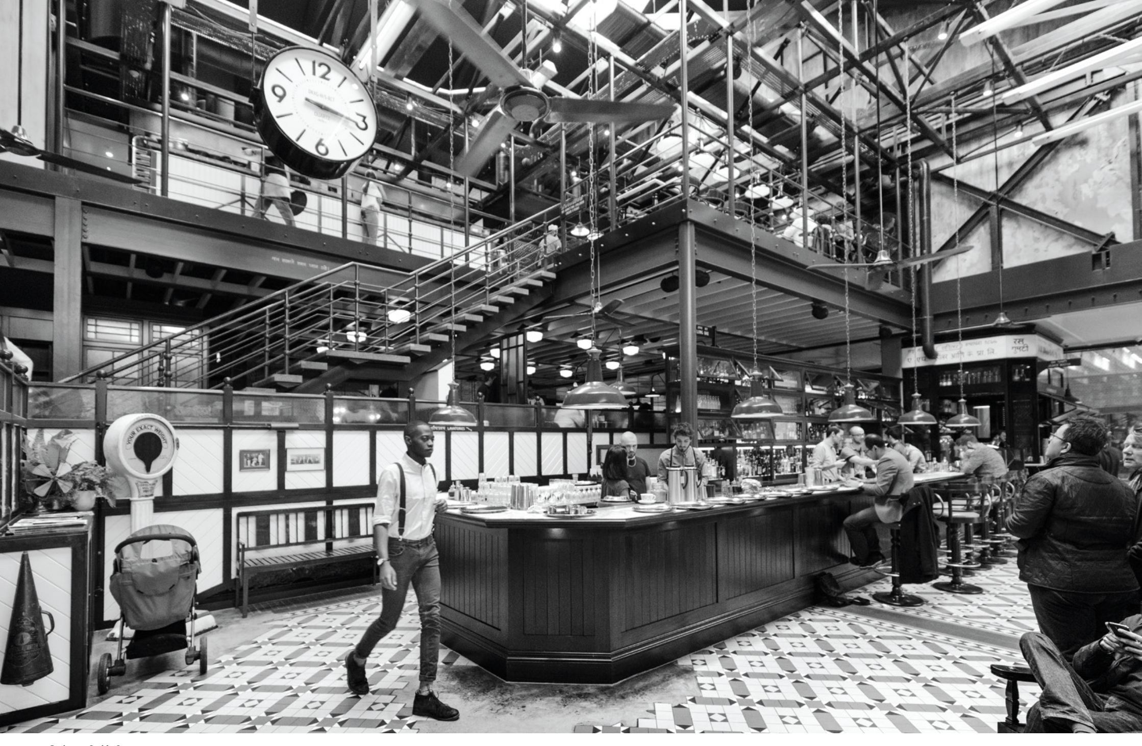
Dishoom, Stable Street