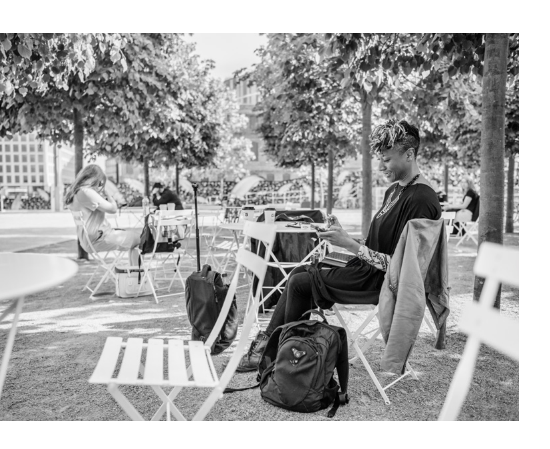
At the heart of King's Cross are the restaurants and cafes, the fountains and trees of Granary Square, all fed by the width and drama of King's Boulevard.